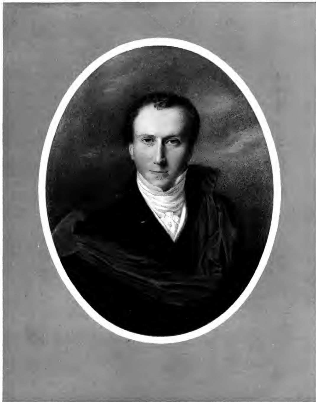
PORTRAIT OF THE ARTIST (1793-1865) BY FERDINAND GEORG WALDMÜLLER